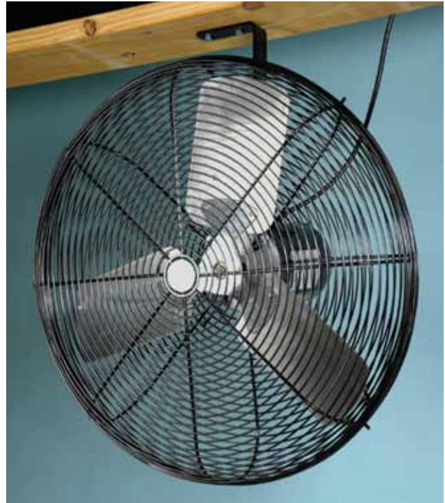
20-Inch (508 mm) Diameter Basket Fan with Ceiling Mount Bracket